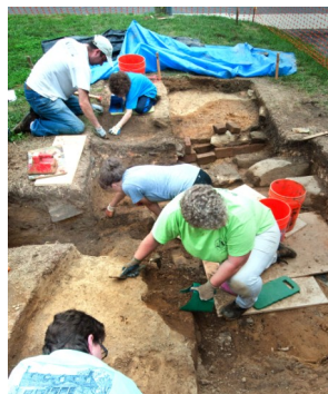
Digging into the local past

The meeting begins at 7:30 p.m. in Carlin Hall.