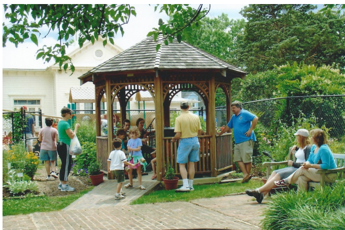
Circa 2002, neighbors at the Gazebo after Gazebo Raising Day