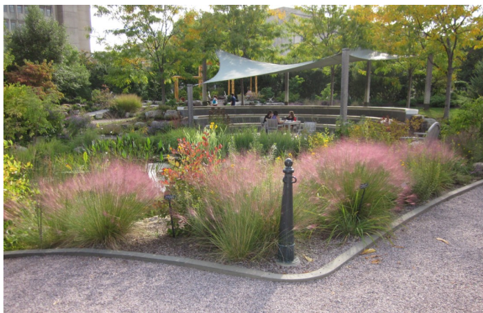
Drifts of Muhly Grass in a naturalistic landscape at the National Garden, USBG

You can read more about the care and maintenance of most of these grasses under Tried & True Native Plant Selections for the Mid-Atlantic at the web site of Master Gardeners of Northern Virginia: mgnv.org .