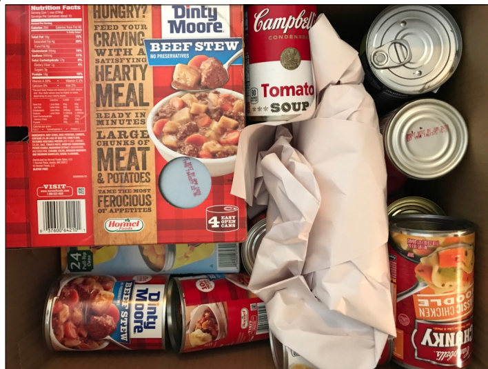
Some of the supplies heading for Houston to help victims of Hurricane Harvey.