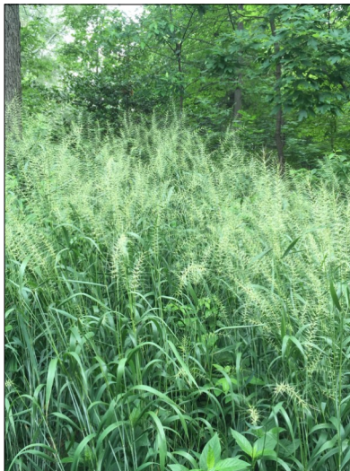
A massed planting of bottlebrush grass at Long Branch Nature Center]

Little bluestem, a drought-tolerant, warm-season bunch grass indigenous to prairies,