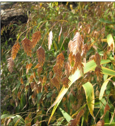
Dried seed heads of Northern Sea Oats at the Glencarlyn Library Community Garden

Some of these members of the Poaceae family are well-suited to the home landscape where they can bring structure, subtle color, texture, and even sound to garden beds well into the winter months.