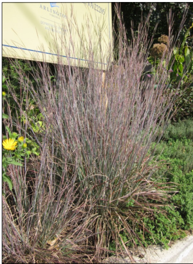
Foliage of Little Bluestem at the Sunny Garden at Bon Air Park

open woods, and sand dunes, can provide either a vertical accent in a sunny garden or erosion control when planted en masse on a slope. The plant measures two to four feet tall, and the mature stems are 1/4-inch wide with gray-green or blue-green coloration and lavender-tinged bases.