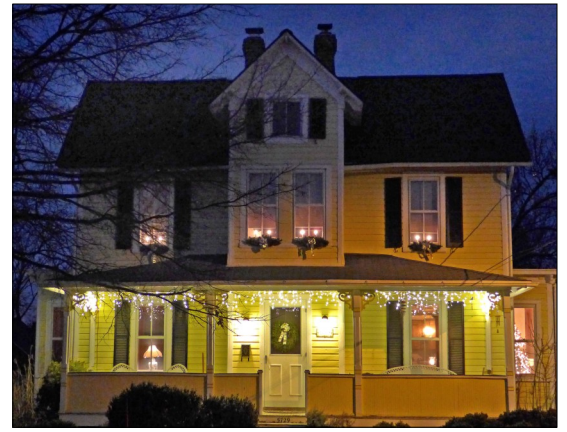
Martha Stuart — DIY