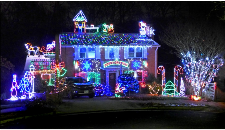
Honorary Lifetime Achievement