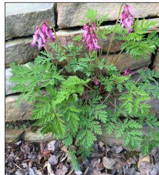
Wild Bleeding Heart

shorter, has lacier, fern-like foliage, and its heart-shaped flowers are smaller and longer.