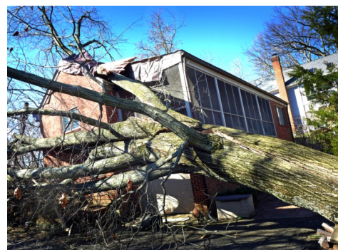
A large oak felled by high winds rests on the kitchen roof

The tree "has got to be over 100 years old," Felsenheld said. And it has been