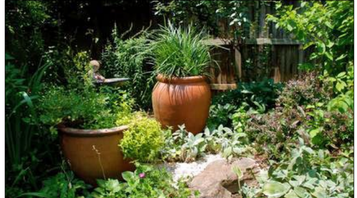
The author's garden in summer.

Turn your pile every few weeks, rotating the outside materials to the inside, and check moisture. Adequate water and warm temperatures will increase the rate at which the microbes work.