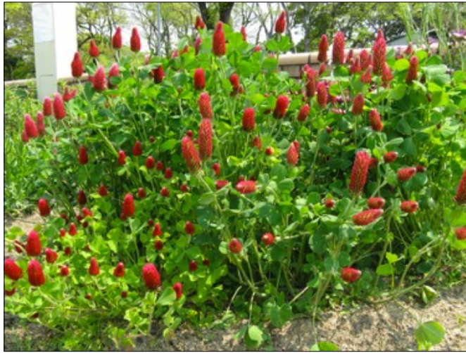
Crimson clover, an upright winter annual legume that grows 1-3', sports striking crimson blossoms. And can be used as a cover crop.

comprised of winter rye, field peas, ryegrass, crimson clover and hairy vetch.