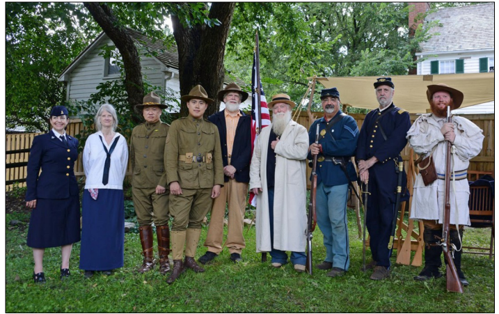
Military reenactors bring history alive at the Ball-Sellers House from the Revolutionary War to World War II.

Kids and adults alike had fun learning about each resident and what it would have been like for each to serve in the military. The fun continues in September and October. On Sunday, September 16, we’re participating in Autumn Fest hosted by the Glencarlyn Community Garden. We’ll be open on Sunday for free tours from 10 am -3 pm and we will have an information table at the library. On Saturday, September 29, we’ll host the ultimate “foodie”