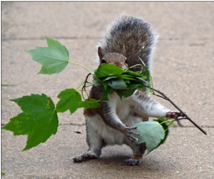
A squirrelly move Photo: and text: Sarah Selenich

This mother squirrel moved her family and nest from one tree to another on the 5600 block of 4th St. South on July 24. She carried each of her four kits about 20 yards to their new home — completing the task in about 15 minutes. She bit off fresh twigs to build the new nest. The photo shows her transport technique.