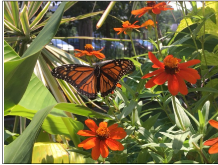
Monarch butterflies are one of the Audubon at Home Sanctuary Species

program is documenting visits by at least 10 of the 42 "Sanctuary Species" locally designated by the program as needing support. The garden co-coordinators hope that garden visitors will look for and document those animals.