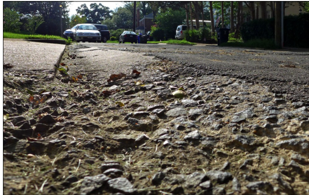
Top surface of a portion of the rain gutter in the 5600 block of 2nd St. South has deteriorated and washed away.

The cut covers the next two fiscal years. The cut does not impact two Glencarlyn projects