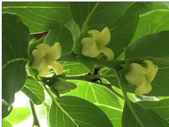
Creamy greenish-yellow flowers appear in late May

spring largely hidden by foliage. They can be pollinated by the wind or long-tongued bees.