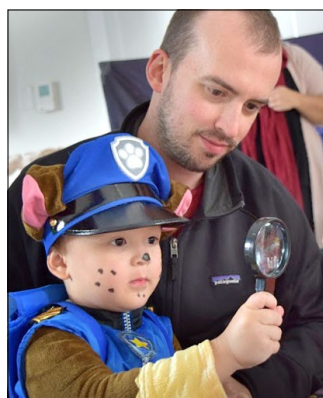
Dan (Paw Patrol) investigates