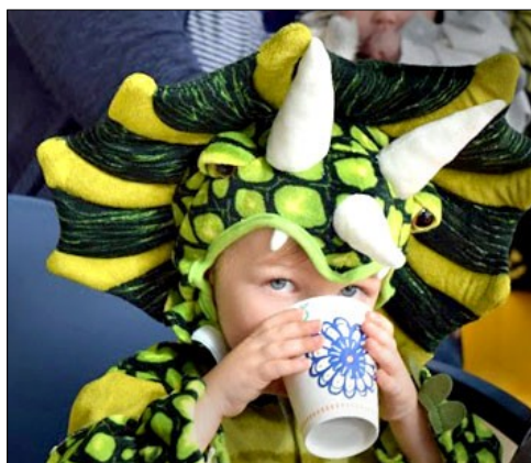
Pierce the triceratops takes a break.