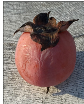
Ripe fruit ready for eating.

Native persimmons have a very soft jelly-like texture, making them too fragile for shipping. Therefore, many people are more familiar with the larger, peach-sized fruit of the oriental species Diospyros kaki , which can be found in grocery stores in the fall. This species, among the oldest trees in cultivation in Asia, was introduced to California in the 19 th century. Modern cultivars, such as 'Fuyu' do not contain tannins when firm and can be eaten at any stage of ripeness.