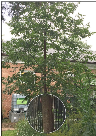
Diospyros virginiana with detail of scaly bark.

This tree is Diospyros virginiana , the common or American persimmon, a plant native to the eastern and midwestern United