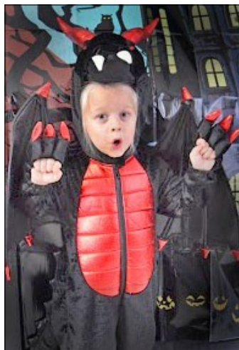
Mason the dragon being fierce