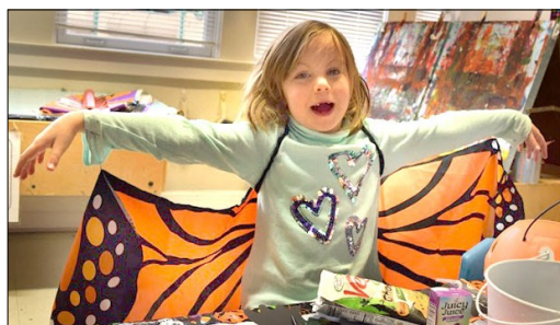
Stella, the butterfly, spreads her wings.