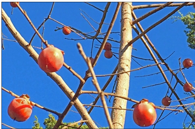
Ripening fruit on the persimmon tree after leaf drop in November.

A medium-sized tree along the fence line bordering the herb beds at the Glencarlyn Library Garden may not catch attention during much of the year. In November, however, the eyes of visitors are easily drawn to bright orange fruits suspended from its bare branches.