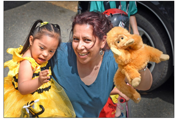
Even the stuffed monkey gets into the parade.