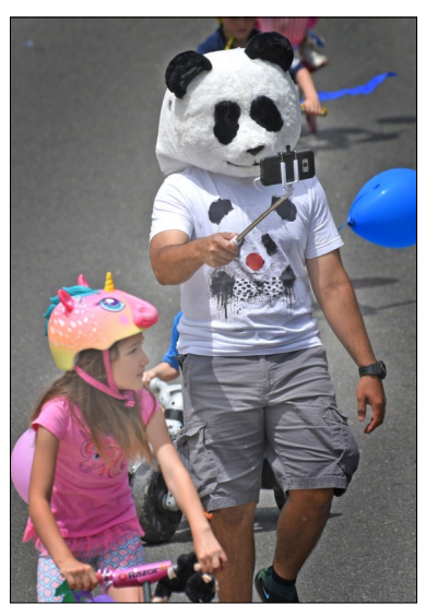
Panda taking a selfie.