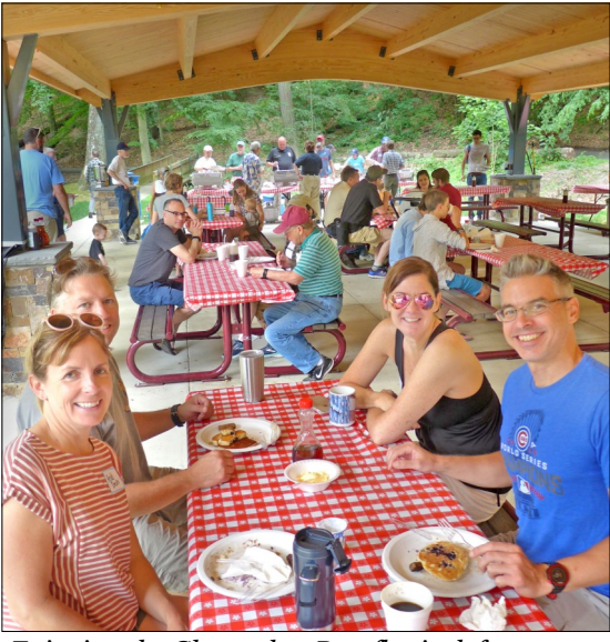
Enjoying the Glencarlyn Day flapjack feast.