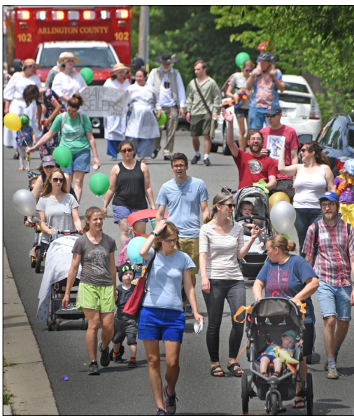
Parade participants underway.