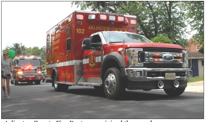
Arlington County Fire Dept. crews joined the parade.

These are popular with the kids on Glencarlyn Day. The Moon