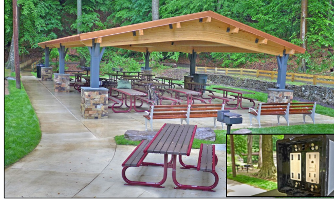
The new pavilion The picnic pavilion comes complete with electrical and USB charging outlets (insert) located on the four corners of the structure.