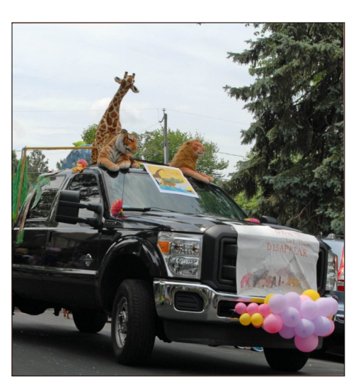
"Don't let them disappear" the banner reads about species extinction