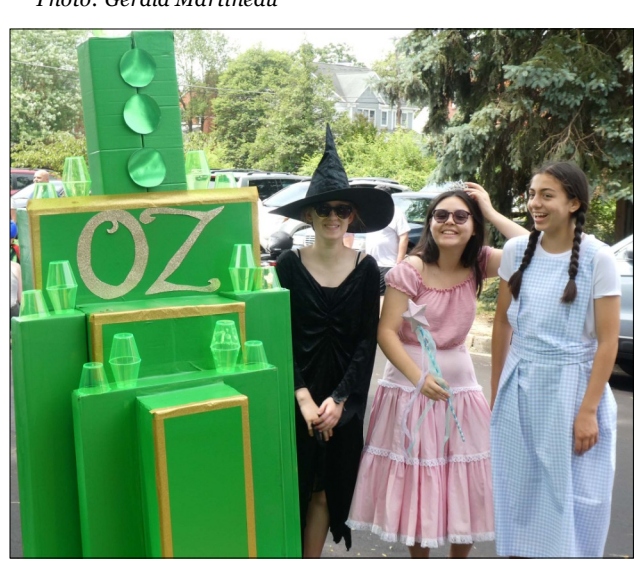
Looking for the yellow brick road?