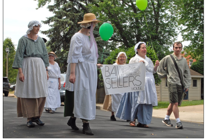
Historical Society reenactors call attention to the Ball Sellers House.