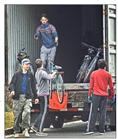
Loading the bikes in Glencarlyn.

He thought a bicycle could make a big differ-