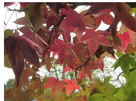
Sweet Gum ( Liquidambar styraciflua )

But even the U.S. Forest Service waxes lyrical in their descriptions: "As the days grow shorter, and the nights grow longer and cooler, biochemical processes in the leaf begin to paint the landscape with Nature's autumn palette." One of the many great things about being a Master Gardener is that it is such fun to always be learning. To read the science, but also have descriptions of the beauty and mystery of "fall color" and "winter interest" that come in language that ignites our imaginations. We are invited to take time to be outside and notice the beauty and mystery, the many gifts of our natural world.