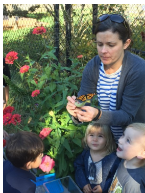
Monarch Butterfly Release

Surprises of the Summer Garden. You may have to bend over and look carefully to see the beginning of what becomes one of the more enchanting series of surprises of the summer garden. Adult monarch butterflies lay their eggs on milkweed leaves because it is the only plant that baby monarch caterpillars can eat to grow to adulthood. You will need very sharp eyes and a lot of patience, carefully turning over individual leaves of any of the three types of milkweed native to our area. You are looking to find tiny singular cream-colored eggs (up to three on a leaf) or tiny (1/4 to 1/2 inch) baby caterpillars. In fact, children often see the eggs or small larval caterpillars first, since they are built closer to the ground! Over a period of just 30 days, each of the four unique stages of the Monarch butterfly's development (egg, larva/caterpillar, pupa/chrysalis, butterfly) is continually awe-inspiring. Witnessing any one of these transformations is a small miracle and a gift that brings surprise and delight. Here is a link: https://www.activewild.com/life-cycle-of-the-monarch-butterfly