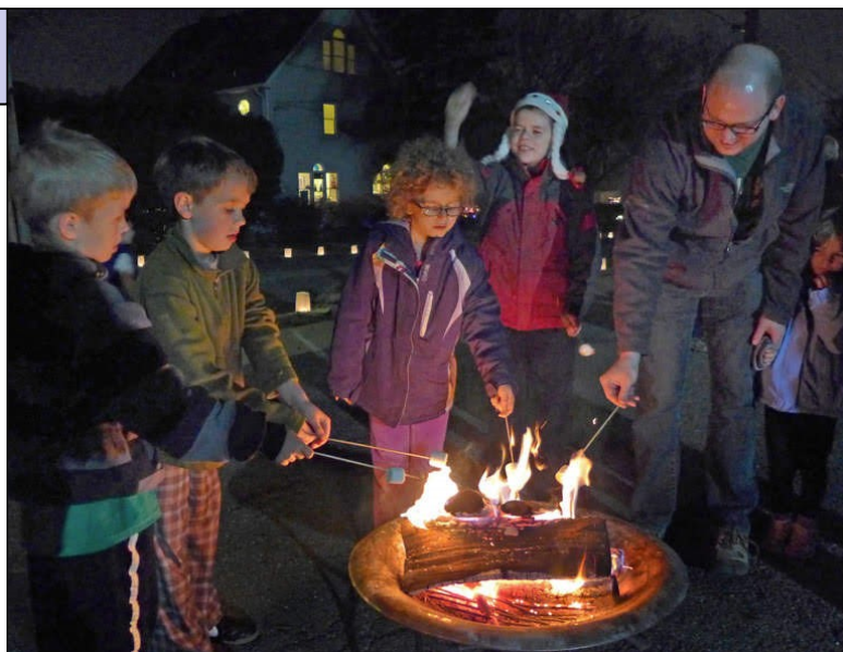
Holiday Party

Learn about buying and selling our homes, current trends in real estate, home improvements and returns on investment, the Amazon effect, and much more.