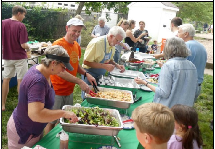
Neighborhood Volunteers helping at last year's Friday Night BBQ

Contact Julie Lee jfblee@aol.com , 808-384-4954.