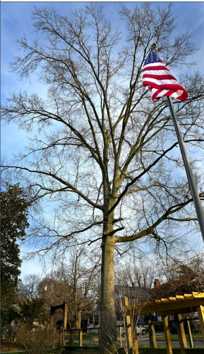
Pin Oak on 3rd St S., approximately 35 ft tall.