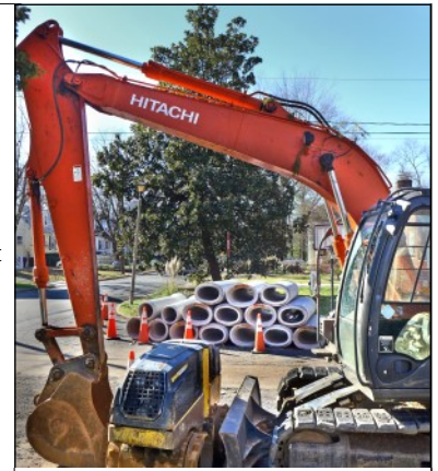
Construction Equipment on S. Kensington

This project was approved for funding by the Arlington County Board on November 19, 2019. The project must now go out to bid for award to a construction contracting company. A Final Design Review for residents will take place. Timing on these next steps is not certain, but most likely will not occur before the third quarter of this year. For details on the project scope, please see the NC Activities tab at Glencarlyn.org .