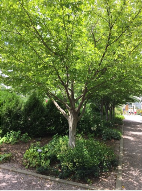
Even in winter, the blue-gray bark with long, sinewy ridges of the American Hornbeam is a lovely addition to the landscape.

Over summer 2019, Master Gardeners renovated the Glencarlyn library's parking lot beds. This included adding more than a dozen native plant species, many new to the garden. Similarly, our spring and fall festivals now include Hill House, a vendor that specializes exclusively in native plants. You may be wondering: What are "native plants" and what accounts for Library Garden's new emphasis on them?