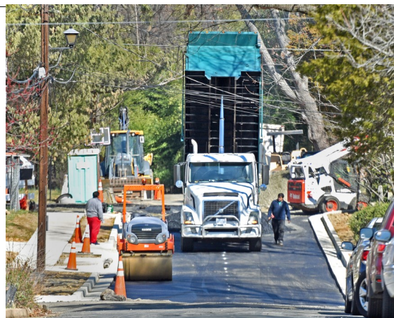
Construction on S. Lexington St

A Final Design Review will be scheduled when county engineers complete the design work; the exact date had not yet been determined as of March 10. This meeting will give property owners a final opportunity before construction to ensure that the NC project has been designed as scoped and funded, and that any modifications agreed upon at the initial Concept Design Review meeting have been incorporated into the design. Minor design modifications may be made to the design following this meeting, but the larger aspects of the scope of the project were fixed when the project was funded in November 2019. For details on the project scope, please see the NC Activities tab at Glencarlyn.org .