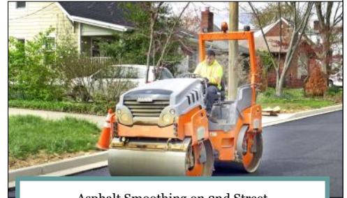
Asphalt Smoothing on 2nd Street