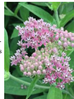
Pink-flowered Swamp Milkweed ( Asclepias incarnata )

Pink, Purple, White: Two other locally native milkweeds grow along our roadways as well as growing in the parking lot gardens and Monarch Watch cemetery gardens. Both Swamp Milkweed ( Asclepias incarnata ) and Common Milkweed ( Asclepias syriaca ) are pink flowering and have scented blooms, though their leaves and growth patterns are quite different. Common milkweed is aggressive in a home garden, but if you have a field or a large lot, the blooms are pretty and the interesting pods holding the seeds are filled with a beautiful white floss. Asters come in all three colors. In late summer, they can be found blooming along roadsides all up and down the eastern US. New England Aster ( Symphyotrichum novae-angliae ) is the most common with its array of small daisy-like purple flowers above tall stalks. Heath Aster ( Symphyotrichum ericoides ) is another native, but unlike its cousins, blooms mid-September in sun to part-shade and has small bright white flowers all along its stem. In our garden, New England Aster grows along the patio fence garden and Heath Aster thrives in the 3rd Street native garden. Liatris, Ironweed, and Joe-Pye-Weed are each unique native plants with unusual growth and flowering habits. Look for their identifying signage and late summer blooms in shades of pink and purple. Notice as well how much they are loved by our bees, butterflies, and other pollinators.