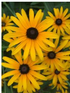
Bright yellow flowers of Orange Coneflower ( Rudbeckia fulgida )

Yellow: Tall Goldenrod ( Solidago altissima ) is one of the many yellow wildflowers that brighten our roadsides. The variety of Goldenrod called 'Fireworks' for its sprightly yellow blossoms arranged along a graceful stem, can be seen in both the pollinator and gazebo gardens. (This is not the plant that makes people sneeze; that is ragweed.) Each summer the yellow petals of Black-eyed Susans ( Rudbeckia hirta ) and Orange Coneflower ( Rudbeckia fulgida ) are abundant along the Third Street walkway to the Library entrance and on the path into the woodland/shade garden. Later in the season, you can see their black seed heads standing upright to feed finches and to self-seed, starting new plants for next year's crop. Six-foot tall and bright yellow, Mullein also self-seeds and is often seen blooming along roadsides. Though considered invasive, many love its dramatic rosette of woolly leaves and tall yellow-flowering stalks which appear in different locations in the garden each year. Another yellow flower that is common to roadsides and the garden, plus much beloved by children, (usually one we gardeners would rather not claim, even as it makes its claim on us) is the Dandelion!