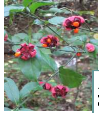
Euonymus americanus (Strawberry bush)

Contact arlmtgs@patacs.org for Zoom details www.patacs.org Visitors welcome!