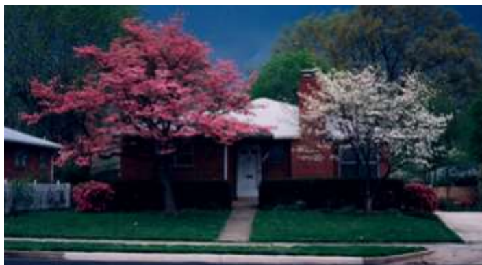
Original landscape of front yard in 1992

My decision to remove most of the turf grass from my yard germinated over many years and after learning about the state of the nation's lands and waters. What's the connection? Our love affair with our lawns – with a thick green carpet of grass, free of weeds – comes at a steep cost to the environment.