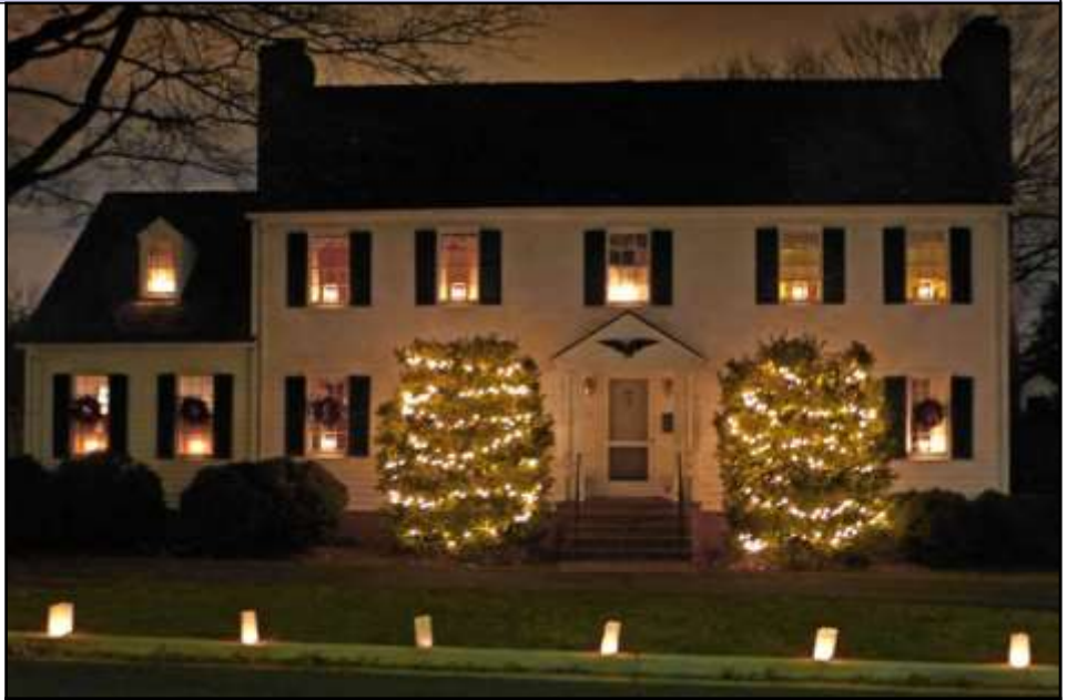
Luminaria in front of 301 S. Kensington Street

As it begins to get dark, usually around 5:30- 6:00 p.m., light your Luminaria, walk the neighborhood, and admire the Luminaria. Even if you won't be placing Luminaria in front of your home, you are encouraged to join in the neighborhood stroll. This is a wonderful family activity and a great opportunity to safely greet your neighbors.