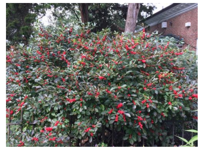
Winterberry (Ilex verticillata)

berry (Ilex verticillata), a deciduous holly of 6 to 12 feet. Its brilliant fruit matures on female plants from late August to