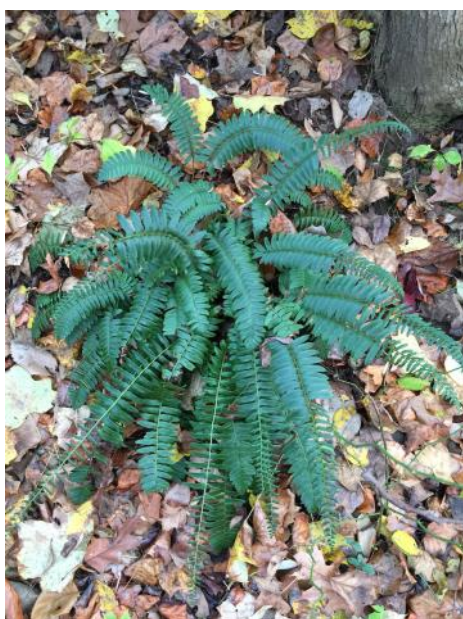
Christmas Fern (Polystichum acrostichoides),

At ground level, Christmas Fern (Polystichum acrostichoides). located in the shade garden, can be used under shrubs and trees, along shaded walls, on slopes, or in woodland and rock gardens. This plant, which gets its common name from its evergreen nature and its stocking-shaped pinnae, forms a circular, cascading clump of one half to two feet that increases over time, offering cover to