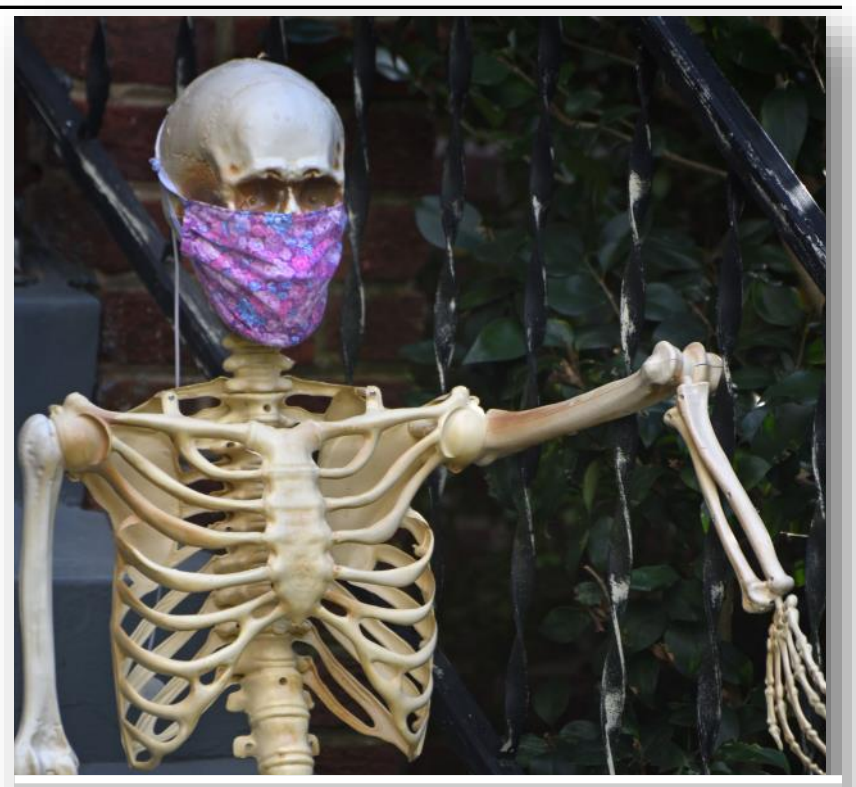
Spooky Skeletons and Candy Chutes OH MY!

To subscribe, send your name, email address and home address to: gcaupdates@glencarlyn.org