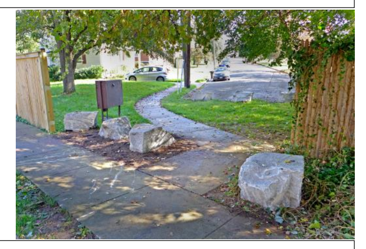
Photos of the new side walks and fence openings on South Manchester Street connecting to 1st and 2nd Street