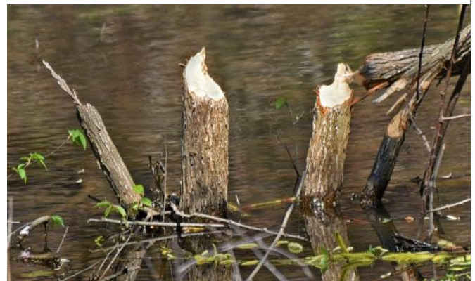
Top : Mallard Swimming in Sparrow Pond Lower : Trees Chewed by Sparrow Pond's Beavers