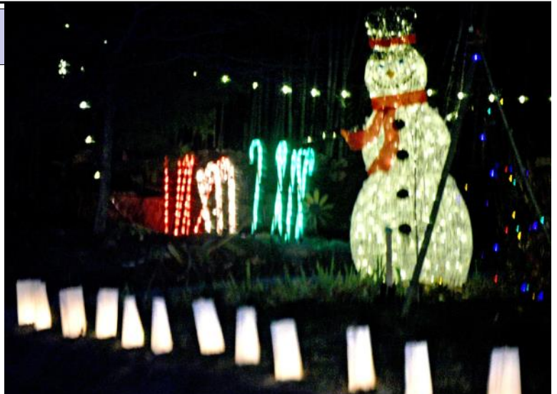
Luminaria and holiday lights in front of the Costello family home

You MUST SUGN UP for the GCA UPDATES to receive the ZOOM link. Sign up by emailing your name and house address to: gcaupdates@glencarlyn.org