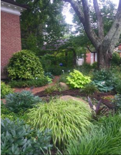
Variation of foliage texture in the Asian Garden (Paul Nuhn)

A Chinese garden creates a miniature landscape, expressing the partnership between nature and man. By comparison, a Japanese garden uses natural settings and background imagery to encourage reflection and spark inspiration. Our Asian garden uses bits and pieces from each region.