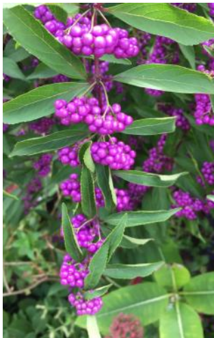
Colorful fruit of Japanese beautyberry (Elaine Mills)

Using plants, like shrubs grouped together to form a grove as in our sweet box ( Sarcococa ruscifolia ), grasses like Japanese sedge ( Carex