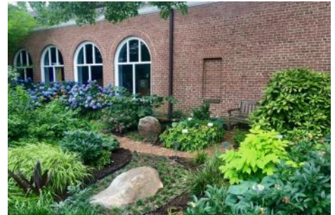
Boulders, mondo grass "water" and garden path

Leaf texture and color bring out difference in these forms. With imagination you can wander through a valley, cross a lake or stream, encounter a mountain. Using the bench for a short rest gives you time for respite and contemplation.