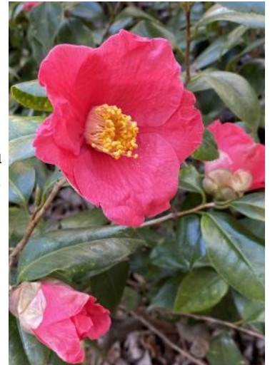
Flowers of 'Spring's Promise' camellia (Elaine Mills)