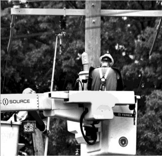
Dominion Power personnel install a new power pole along the 5600 block of 4th St S. in preparation for the upgrading of the 5500 and 5600 blocks

The construction contract has been approved and awarded for this project. Construction scheduling has not yet begun, but project work is anticipated to start this summer following completion of the underground utilities work. A pre-construction meeting will be scheduled 1-2 weeks prior to the start of hardscape work.