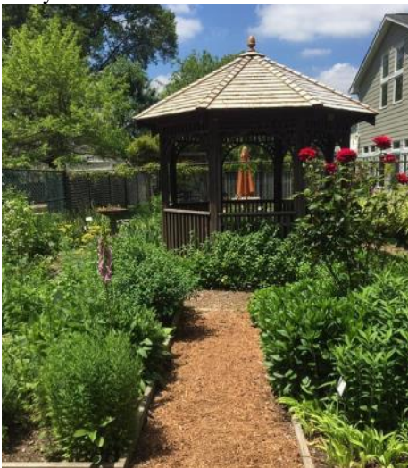
The gazebo is a favorite feature of the Garden.

Other popular features included the representation of the different garden conditions (sunny, shady, wet, dry), styles (Asian, native, herbs) and plantings; the feeling of peace and tranquility that the garden's carefully curated plantings engender; the Gazebo and benches that invite visitors to relax and take in the sights and sounds; the opportunity to watch the garden change over the seasons, and the advice and problem-solving skills of Master Gardeners — with special gratitude expressed for the garden's founders, Judy Funderburk and Paul Nuhn.