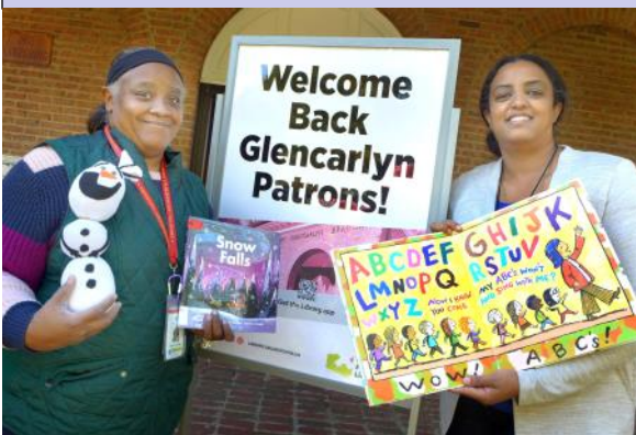
Glencarlyn Library Staff welcoming back visitors

Arlington County tracks library usage. Let's increase Glencarlyn's numbers.