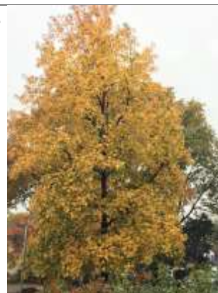
Sweetgum foliage has outstanding fall color

When considering the addition of trees to our properties, there are excellent reasons for considering native tree species . These plants have adapted to our local soil and water patterns and, when properly sited for sun and moisture preferences, they are likely to do well without our resorting to fertilizers and pesticides. Mostly importantly, they have long-standing relationships with local wildlife, providing food, cover, and nesting sites for a wide range of animals from insects to birds and mammals. Planting one oak tree, for example, can offer critical support to our dwindling populations of butterflies and moths whose caterpillars are, in turn, the required food for raising young birds.