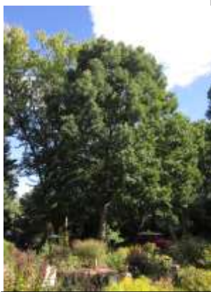
White Oak provides excellent support for wildlife

Trees release essential oils that have been shown to benefit human health by improving immune response, decreasing inflammation, and reducing cortisol levels. Studies have demonstrated that even having views of trees can speed patients' recovery from illness and surgery in hospital settings.