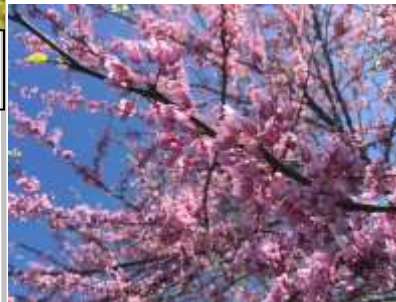
Eastern Redbud offers early nectar for pollinators

Learn more about desirable native trees at the upcoming Tree Walk scheduled for 1:00 p.m., Saturday, April 23, at Glencarlyn Library Community Garden's Spring Celebration and Plant Sale.