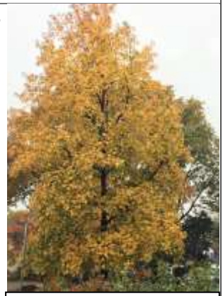
Sweetgum foliage has outstanding fall color

When considering the addition of trees to our properties, there are excellent reasons for considering native tree species . These plants have adapted to our local soil and water patterns and, when properly sited for sun and moisture preferences, they are likely to do well without our resorting to fertilizers and pesticides. Most importantly, they have long-standing relationships with local wildlife, providing food, cover, and nesting sites for a wide range of animals from insects to birds and mammals. Planting one oak tree, for example, can offer critical support to our dwindling populations of butterflies and moths whose caterpillars are, in turn, the required food for raising young birds.