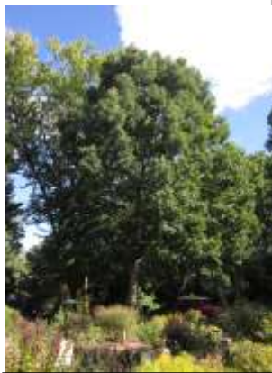
White Oak provides excellent support for wildlife

Trees release essential oils that have been shown to benefit human health by improving immune response, decreasing inflammation, and reducing cortisol levels. Studies have demonstrated that even having views of trees can speed patients' recovery from illness and surgery in hospital settings.