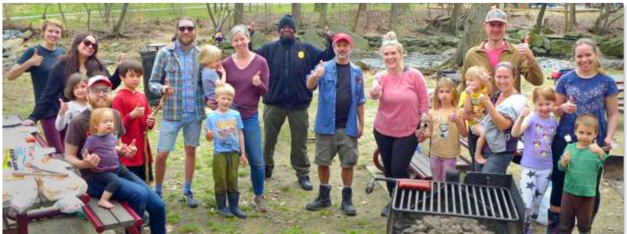
Stream cleaning volunteers pose with an Arlington Park Ranger, (center of group) and give a "thumbs-up" gesture following a snack of hot dogs and toasted marshmallows.

A mom uses a mechanical pickup tool to reach for trash between two large rocks near the Glencarlyn Dog Park.