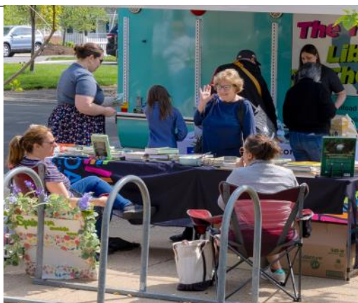
Library Garden Truck photo showing books for sale to benefit Friends of Arlington Library.