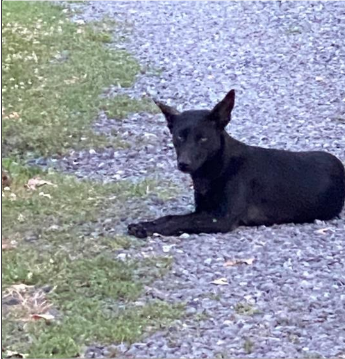
Black coyote seen on 5th Street in July 2021

Thanks to Alonso Abugattas for providing much of this information.