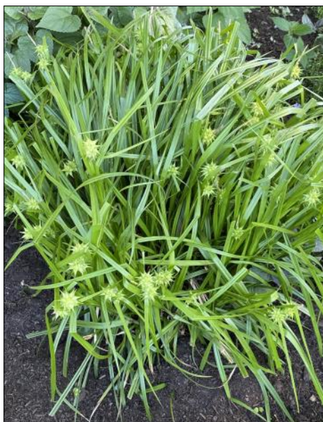
Grass-like foliage and mace-like seedheads of Gray's sedge

Gray's sedge ( Carex grayi ) is a two- to three-foot-tall perennial sedge that forms slowly spreading clumps. It's shiny, lime-green, grass-like, pleated leaves measure 1/2 inch wide by 14 inches long and are semi-evergreen in our climate. The plant's most noteworthy characteristic is its greenish-yellow seedheads that resemble medieval spiked clubs.