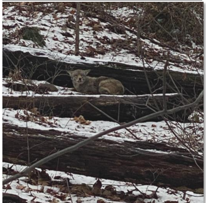
Gray coyote hides behind Long Branch Nature Center January 2022

Our local coyotes are 'Eastern coyotes', larger than the older strain found in the US west. Historically, their travels east resulted in this larger strain. That is, our Eastern Coyotes are a mix of three species: approximately 60% western coyote that have expanded their range, about 30% Algonquian wolf picked up on the way here from up north, and the remainder dog. This 3-way mix is what makes up our larger Eastern coyote. Some people call them coy-dogs or coy-wolves, but this is not the case in the East. The mix of all three makes up our Eastern coyote.