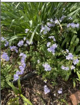
Ladder-like foliage and lavender flowers of Jacob's ladder

These transition to a warm brown as seeds form and can be attractive in dried flower arrangements. This sedge prefers moist soil and light shade to part-sun, although it can tolerate drier conditions. It is equally attractive as an accent plant or massed near pools or in a rain garden.