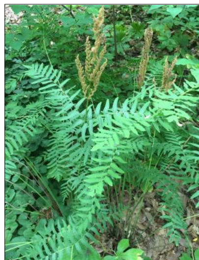
Tall sterile fronds and spore-bearing structures of royal fern

Royal fern ( Osmunda spectabilis ) is one of North America's largest native ferns, reaching up to six feet in height. It grows in tall, erect clumps that can provide cover for wildlife. Woolly, hair-covered fiddleheads emerge in the spring developing into thin, translucent, light green foliage with rounded, well-separated leaflets on sterile fronds. Spores are borne in bead-like structures and are released in the wind when the fertile clusters mature from green to bronze in April and May. This fern adds a graceful accent to partially to fully shaded landscapes with moist to wet conditions such as rain gardens and pond edges.