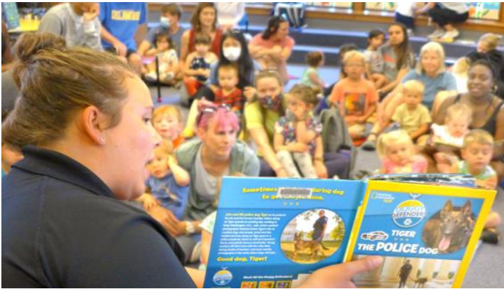
Members of the Arlington County police department take part in a "Preschool Police Storytime" at the Glencarlyn Branch Library