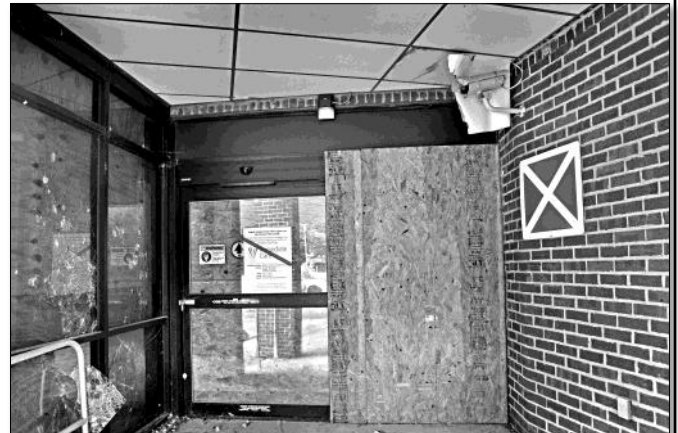
Boarded up entryway to Urgent Care

As of early August 2022, the "Phase 1" decoupling is almost completed and should be finished by September. Meanwhile, the County Board has approved the new Capital Improvement Plan which will provide $7 million in funding for the demolition of the hospital building, Phase 2. An invitation for bids has been issued for that