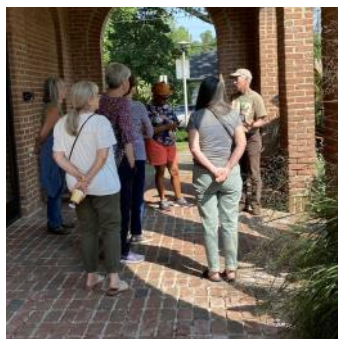
Walking tour of the garden highlights native plants.