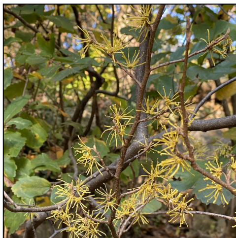
The Library Garden's new native witch hazel