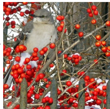
Mockingbird protecting the Winterberry Holly in the Library Garden

Winter: A time for dormancy, rest and renewal. Resting in what has been planted, dreaming of new ways to engage, teach, and bring the beauty and delight of a garden into the lives of all of you, your Library Garden Coordinators hope your wintertime walks lighten its grey days and fill you delight. May it be so for years to come!