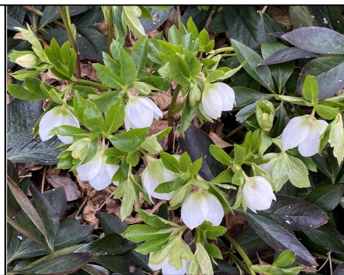
The White blooms of a Christmas Rose ( Helleborus niger )