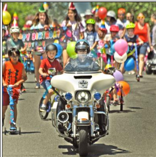
Arlington Police's Motor Patrol leading off the 2022 Glencarlyn Day Parade

We have such an EXCITING GLENCARLYN DAYS WEEKEND planned for this year!! The neighborhood's biggest event will be held June 2nd and 3rd . Friday Night June 2nd is the Community BBQ at Carlin Hall , where we will provide the burgers, hotdogs, sides and beverages for a suggested donation. There will be lots of new and exciting activities and games this year. And our famous 50/50 raffle.