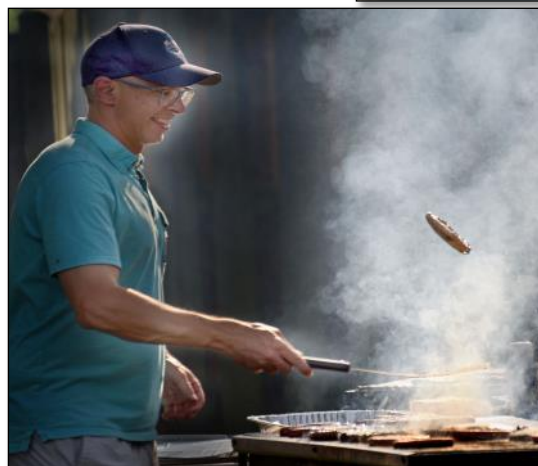
All Glencarlyn Days