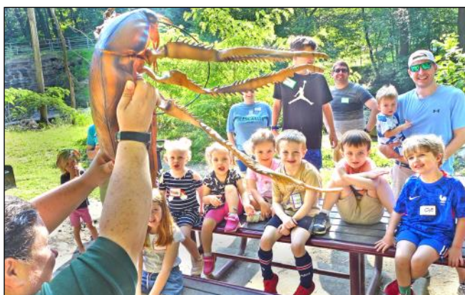
Above: A ranger from the Nature Center displays a large plastic cock roach to an amused group of youngsters