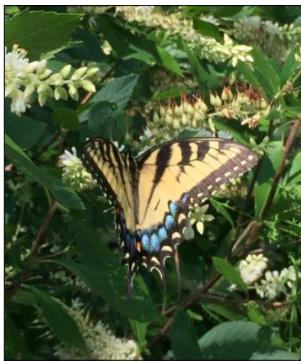
Fragrant flowers of Sweet Pepperbush attract butterflies.

well. Early-blooming species include spicebush ( Lindera benzoin ), black chokeberry ( Aronia melanocarpa ), pinxterbloom azalea ( Rhododendron periclymenoides ), and arrowwood viburnum ( Viburnum dentatum ) which flower from March to April. Among the plants that bloom in May and June are wild hydrangea ( Hydrangea arborescens ), Virginia sweetspire ( Itea virginica ), and common ninebark ( Physocarpus opulifolius ). Sweet pepperbush ( Clethra alnifolia ) has fragrant flowers in the later summer, and Witch hazel ( Hamamelis virginiana ) illuminates the fall landscape with its ribbon-like yellow flowers in October and November.