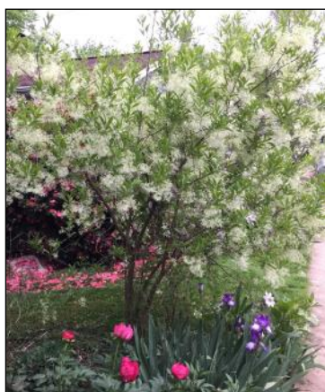
Fringetree is a lovely understory tree for pollinators

There are many lovely native shrubs that support our pollinators as