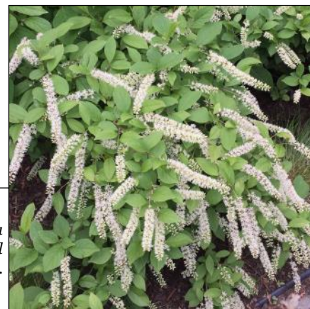
Dwarf cultivars can be a good choice for small gardens.

The full-size straight species of many native shrubs can range from 6 to 12 feet or more in height. For gardeners with very limited space, several native shrubs are also available in smaller cultivars which produce the same insect-supporting flowers. ‘Hummingbird’ is a diminutive cultivar of sweet pepperbush. The ‘Low-scape Mound’ cultivar of black chokeberry measures about 1 to 2 feet, perfect for use as an edging plant. Virginia sweetspire has various cultivars, such as ‘Henry’s Garnet’ (4 to 5 feet) and ‘Scentlandia’ and ‘Little Henry’ (2 to 3 feet). Whether your yard can accommodate canopy trees or only smaller shrubs, you can feel confident that your woody plants are providing sustenance to our smallest garden visitors.