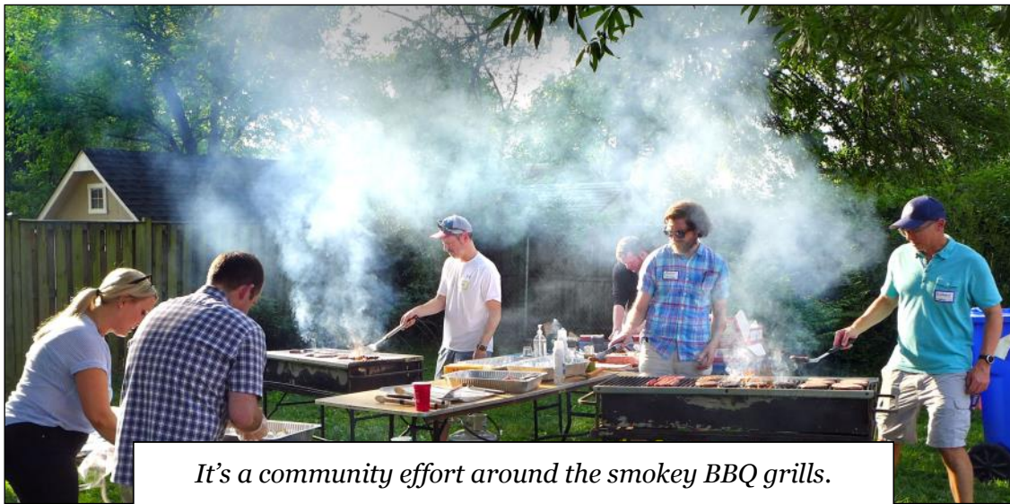
It's a community effort around the smokey BBQ grills.