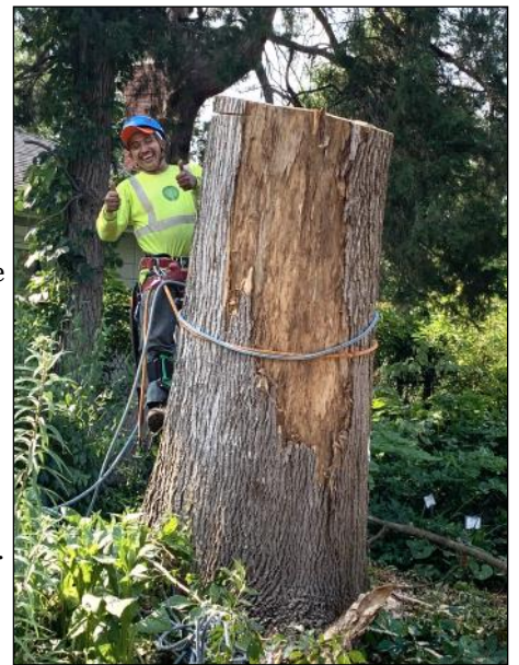
The base of the Ash is ready for removal by a crane