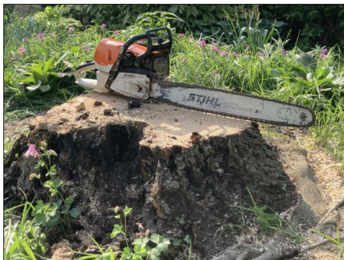
The massive stump of the maple remains in the Asian Garden

After a spring storm brought down several large limbs of the maple, the County Parks and Natural Resources staffers for tree maintenance determined that it posed a danger to the community who pass under its branches, and it needed to come down. A crane was brought in, and the tree was removed.