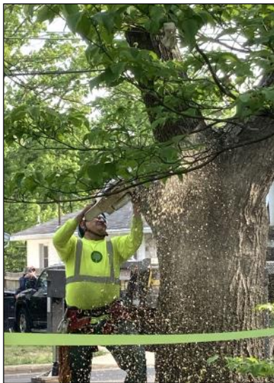
A tree service worker cuts away branches of the maple

How could it be that the Library Garden's two oldest trees needed to be cut down to stumps within weeks of each other? We lost both the shade they provided and our two oldest tree friends who towered over the Woodland/Shade, Native Plant, and Asian Gardens on the south and west sides of the garden. Counting their rings, we estimate that each of them were planted 60+ years ago, probably even before the new brick Glencarlyn Library was built in 1962.