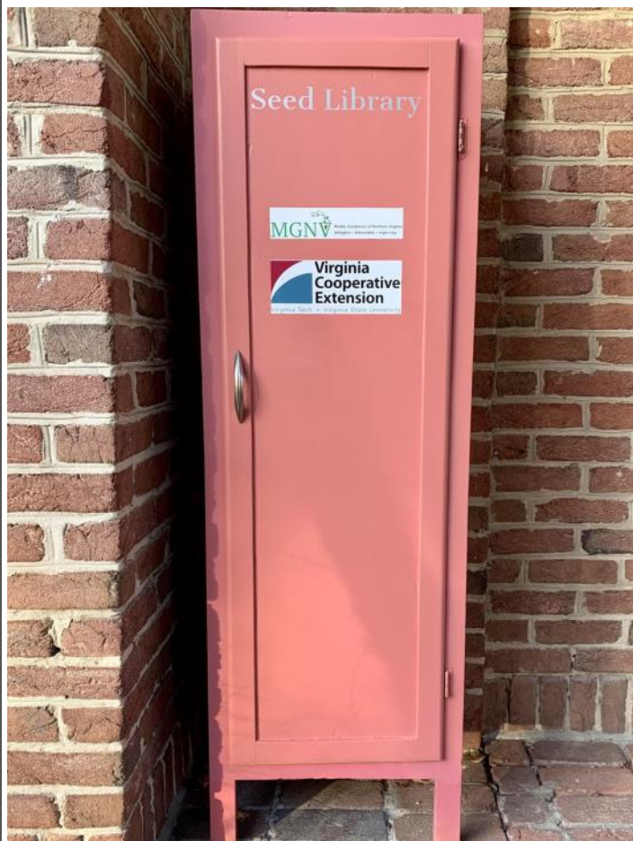
The new seed library in the Glencarlyn Library portico is free for all to use.

If you've walked through the Library's portico in the past few weeks, you may have noticed a new cabinet with the words "Seed Library" on the front. In cooperation with the librarians, the coordinators of the Glencarlyn Library Community Garden are introducing a new resource for gardeners. The seed library has been designed to provide local gardeners with a source of free local seeds for use in their own home gardens.