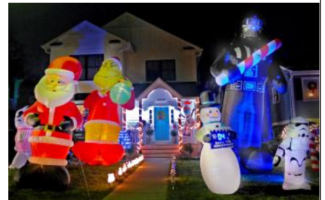
Holiday decorations in the neighborhood.

There is no rain date needed for this event.