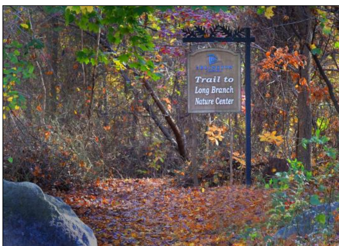
Fall foliage on the trail from Glencarlyn to the nature center.

No registration required. Attendance is first-come, first-served until event capacity is reached.