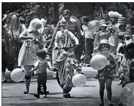
Residents in clown costumes march in an early Glencarlyn Days parade.