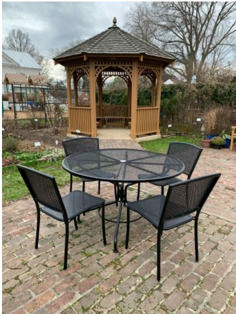
A new table and chairs were funded by donations.

The new Seed Library under the portico has already seen a good deal of success, with many packets of seeds finding new homes. The Coordinators of the Library Garden will be working to keep it stocked with new seeds, and invite