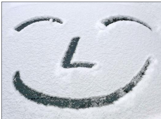
Glencarlyn got about four inches of snow on January 15-16, the biggest snowfall in two years.