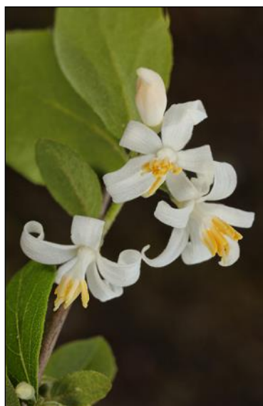
American Snowbell blossoms.

We're looking forward to having several fragrant plants blooming in our patio area in years to come!