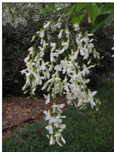
Yellowwood blossoms.

Post Oak has leaves with five deep lobes arranged in a cross-like shape. Brown, egg-shaped acorns appear from September to November, providing food for a variety of animals, including woodpeckers and blue jays. The tree also provides support to the caterpillar stage of the Imperial Moth and several Hairstreak and Duskywing butterfly species.