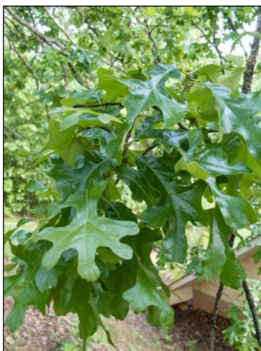
Post Oak leaves.

The large maple at the 3rd Street entrance will be replaced by a Post Oak ( Quercus stellata ), a tree species native to the eastern and central United States. This member of the White Oak Group is a slow-growing species with a dense, oval crown that will eventually reach 40 to 50 feet in height. The USDA describes it as a "beautiful shade tree [that is] often used in urban forestry" due to its resistance to drought, fire, and diseases.