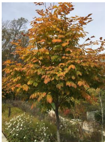
Yellowwood tree in fall.

Yellowwood ( Cladrastis kentukea ), a medium-sized species native to the southeastern U.S., is an excellent specimen or shade tree that eventually reaches 30-45 feet. It has smooth, beech-like bark and graceful branches with bright-green, compound leaves that turn a delicate orange or yellow in the fall.