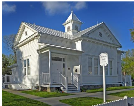
Carlin Hall, built c.1892.

We all will be asked to contribute ideas to Arlington's Vision 2050 and I urge you to participate. And is this a good time for Glencarlyn to create a new road map to reach our goals? What should be done to improve our neighborhood as well as our county? Better public transportation? A larger and/or different form of government? More or less density? How will libraries serve our communities? Will our parks be revitalized by natural trail management, reduction in the deer population, and restoration of the understory? How should S. Carlin Springs Road look? Will children be able to walk safely to school?