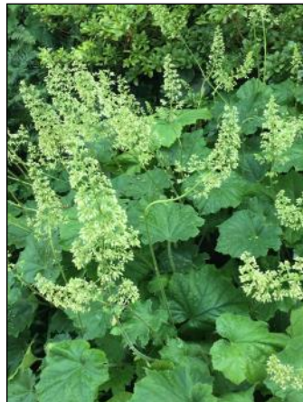
Autumn Bride cultivar of Alumroot.

One reason to choose a cultivar (sometimes referred to as a “nativar”) is to find a compact plant for a small space. For instance, while we have the straight species shrub Virginia Sweetspire in our native plant garden, we have planted the shorter Henry's Garnet cultivar in our patio area and the