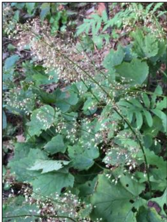
Straight species Alumroot.

Species are designated by an italicized two-part Latin name, while cultivars are indicated by an additional name in single quotes. For example, Heuchera villosa is the scientific name for Hairy Alumroot, and Heuchera villosa Autumn Bride is the name of a cultivar you'll find in the shade garden area of the Glencarlyn Library Community Garden that has been bred for its showy flowers. Using Latin names is a way to make certain you get the plant you want, because multiple plants may be known by the same common name.