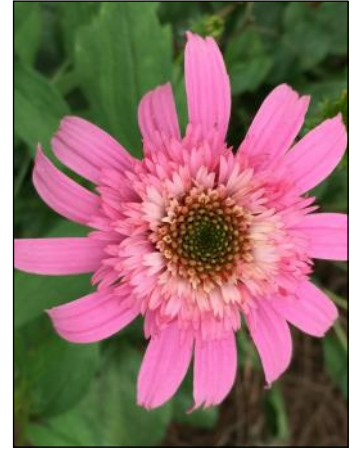
Double-flowered Coneflower is sterile.

can be problematic. First, when the color of a shrub's foliage is changed from the natural green to orange or red, the chemistry has been altered, and the plant will not be palatable for the critical caterpillar stage in the lifecycle of our butterflies and moths. To illustrate, the Amber Jubilee cultivar of Common Ninebark in the cemetery is beautiful but cannot serve as a larval host plant.