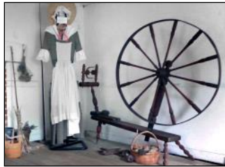
Inside Ball-Sellers House.

Tour the house with a docent who can trace all of Arlington history in this one house. See a colonial era garden and model bee hives.