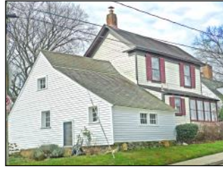
The Ball-Sellers House is the oldest house in the county (c.1750).

Join us April 6 at 1pm at the Ball-Sellers House. This opening day we'll celebrate with music of the colonial era. The Monumental City Ancient Fife and Drum Corps will perform (1:30-2:30), followed by colonial era songs sung by the Guillotine Theatre. Bring a chair and enjoy the show as re-enactors help transport you back in time.