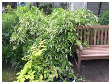
Mid-sized Henry's Garnet cultivar.

One reason to choose a cultivar (sometimes referred to as a “nativar”) is to find a compact plant for a small space. For instance, while we have the straight species shrub Virginia Sweetspire in our native plant garden, we have planted the shorter Henry's Garnet cultivar in our patio area and the