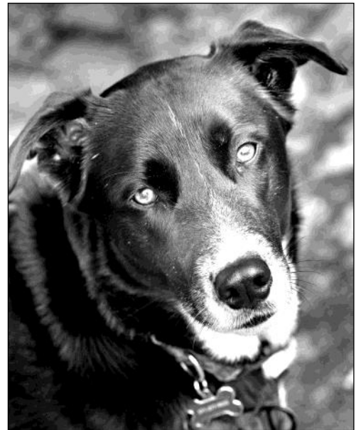
Everett’s handsome face.