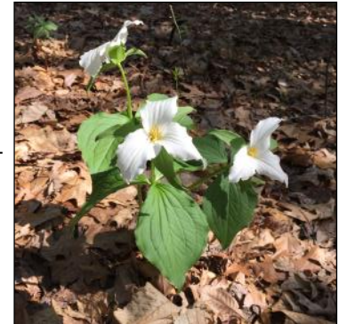
Great white trillium

Appalachian Trail with miles of Trilliums and other native spring ephemerals at the end of April and beginning of May each year.