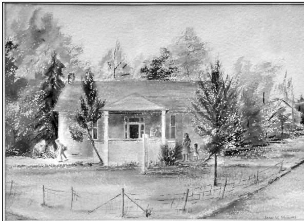
An illustration of the original Samuel Burdett Library

ceremony and cake cutting will be at 1:00 p.m., with members of our Arlington County Board participating. Light refreshments will be served.