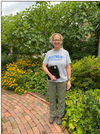
Glencarlyn Garden's New Coordinator