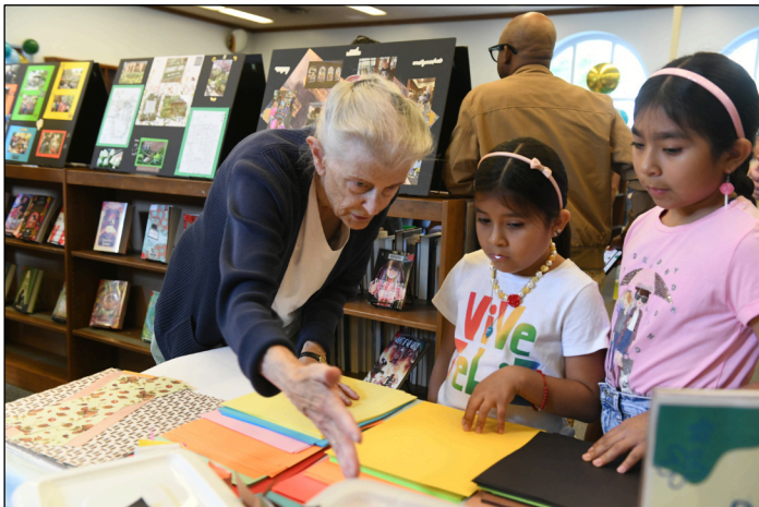
From the Centennial