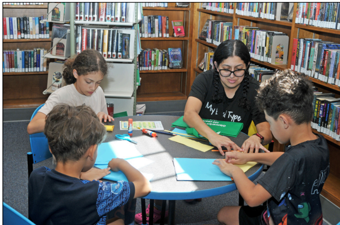
From the Centennial

Have you had thoughts of selling your current home to find the bigger, or smaller home you've been dreaming of? Now might be the right time. Your equity, paired with lower mortgage rates, puts you in a great position to make that move today. To make the best decisions and get the most out of your current market advantage, let's connect to discuss your situation so you have an expert guide through every step of your real estate journey.