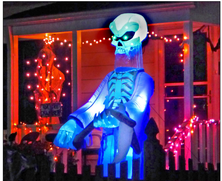
Halloween decorations on 3rd and 4th streets