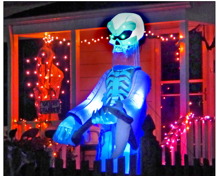
Halloween decorations on 3rd and 4th streets