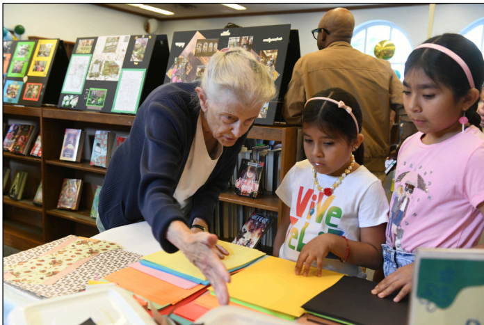
From the Centennial