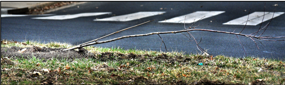
The photo on the left shows trees run over on Carlin Springs Road. Two young saplings were run over by an errant driver in the median of CSR. The county was notified and the trees were straightened up by Arlington County.