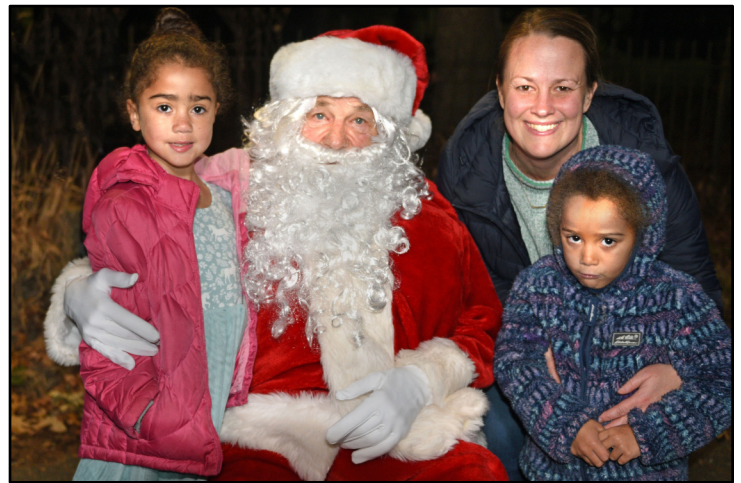
Pictures of luminaria and the holiday party in years past.