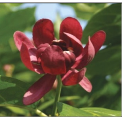
Calycanthus 'Aphrodite' flower.