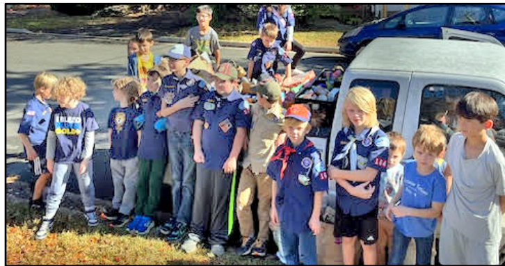
Pack 548 Scouts filled a truck with food donations for AFAC and sorted them on site.

The concert will feature a festive program of seasonal favorites, including selections from Tchaikovsky's The Nutcracker , music from The Polar Express , and other well-known holiday classics.