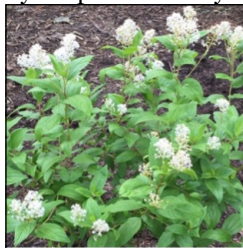
Ceanothus americanus (New Jersey Tea).

Next, we added two Ceanothus americanus (New Jersey Tea) shrubs on either side of the bench in the herb garden border that