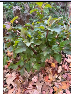
Physocarpus opulifolius 'Amber Jubilee'.

We're keeping our fingers crossed for the two Magnolias, but hope you will come check out these new shrubs as well. Hope to see you in the garden!