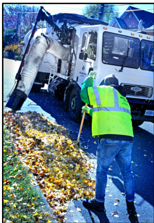
The first round of leaf pickup by Arlington County.